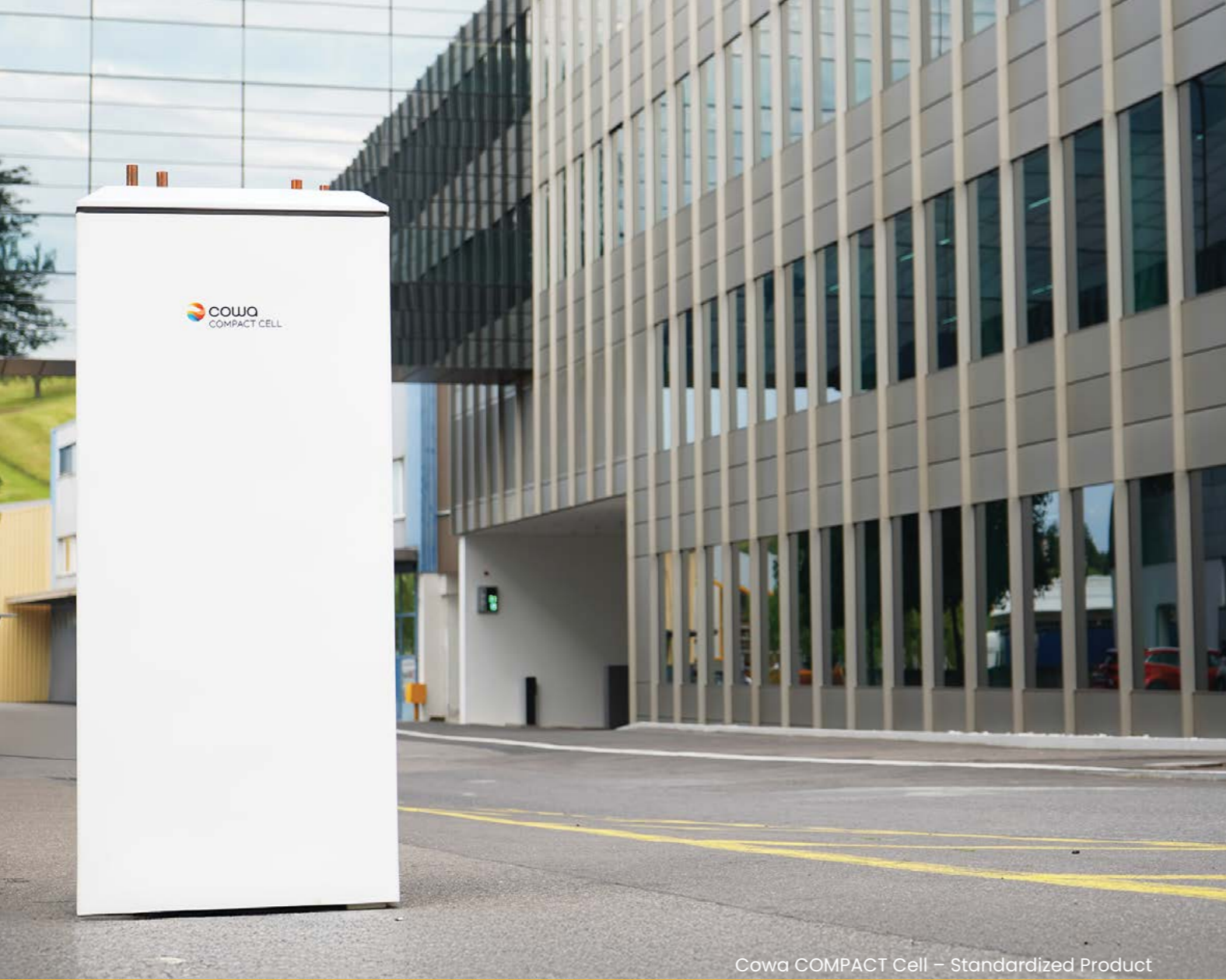
Cowa COMPACT Cell – Standardized Product